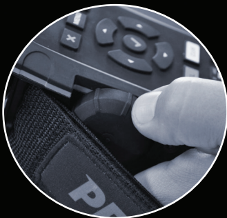
Easy scroll wheel operation