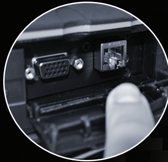
Convenient rubber flaps